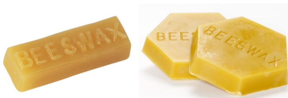
Table 13. Composition of beeswax (after Tulloch, 1980).