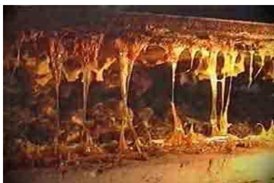
Figure 6. Propolis is a vegetable mastic made by honeybees from resins collected on the bark and buds of certain trees and balsamic plants

from a large variety of trees and shrubs. Each region and colony seems to have its own preferred resin sources, which results in the large variation of colour, odour and composition. Comparisons with tree resins in Europe suggest that, wherever Populus species are present, honeybees preferably collect the resins from leaf buds of these trees. A Cuban study suggests that the plant resins collected are at least partially metabolized by bees (Cuellar et al., 1990). The presence of sugars (Greenaway et al., 1987) also suggests some metabolization by bees, i.e. as a result of adding saliva during both scraping and chewing. A list of the major classes of chemicals occurring in propolis is given below with references to some recent reviews and analyses from different countries. The major compounds are resins composed of flavonoids and phenolic acids or their esters, which often form up to 50% of all ingredients. The variation in beeswax content also influences the chemical analysis. In addition it must be said that most studies do not attempt to determine all components, but limit themselves to a class of chemicals or a method of extraction. The selection of the studies presented here is based on the most recent publications with preference given to the most complete studies or to studies from countries where these are the only references.