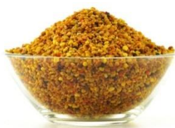
Fig.3 Bee pollen