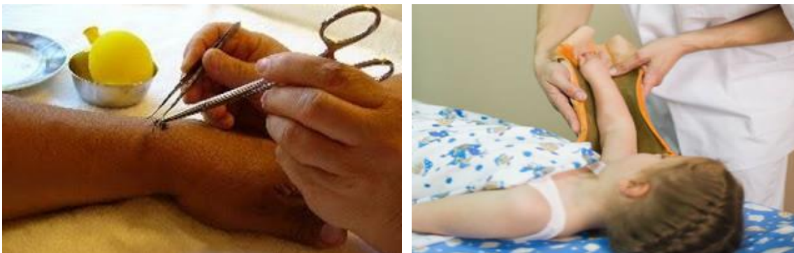
Figure 1. The apitherapy is widespread today