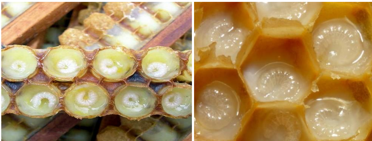
Figure 7. Royal Jell

Numerous chemical analyses of royal jelly have been published over the years. Only recently though, have highly refined technologies given detailed analyses of the unusual composition and complexity of this somewhat acidic substance (pH 3.6 to 4.2). The principal constituents of royal jelly are water, protein, sugars, lipids and mineral salts. Although they occur with notable variations the composition of royal jelly remains relatively constant when comparing different colonies, bee races and time. Water makes up about two thirds of fresh royal jelly, but by dry weight, proteins and sugars are by far the largest fractions. Of the nitrogenous substances, proteins average 73.9% and of the six major proteins (Otani et al., 1985) four are glycoproteins (Takenaka, 1987). Free amino acids average 2.3% and peptides 0.16% (Takenaka, 1984) of the nitrogenous substances. All amino acids essential for humans are present and a total of 29 amino acids and derivatives have been identified, the most important being aspartic acid and glutamic acid (Howe et al., 1985). The free amino acids are proline and lysine. A number of enzymes are also present including glucose oxidase phosphatase and cholinesterase. An insulin-like substance has been identified by Kramer et al. (1977 and 1982).